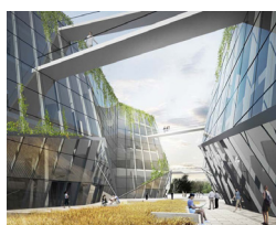
Italian Pavilion at EXPO Milan 2015 Milan, IT | 2013

Architect at Studio Pession Associato | 2011-2013 | Torino, IT