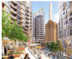
Battersea Power Station - Phase3 Foster + Partners, Gehry Partners London, UK | 2013

Commission | Private Commission Status | Under Construction