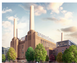
Battersea Power Station - Phase2 Wilkinson Eyre Architects London, UK | 2013

Commission | Competition, first prize Status | Under construction