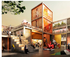
D3 - Dubai Design District Foster + Partners Dubai, UAE | 2015

Commission | Private commission Status | Ongoing