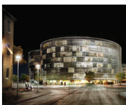
ENI Exploration and Production Headquarter with BIG - Bjarke Ingels Group San Donato Milanese, IT | 2011

Commission | Private commission Status | Completed