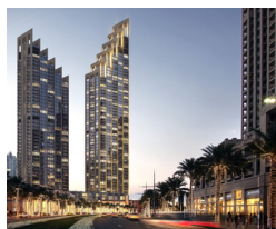
Boulevard Heights Perkins + Will Dubai, UAE | 2014

Commission | Private commission Status | Ongoing