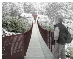
Da Montesinaro all'Alpe Fontana Pié di Cavallo, IT | 2011

Commission | Competition, third prize Status | Idea