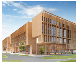
Institut Mines Télécom Grafton Architects Paris, FR | 2013

Commission | Private commission Status | Under construction