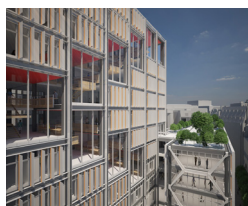
LSE - Center Building Redevelopment Rogers Stirk Harbour + Partners London, UK | 2013

Commission | Competition, first prize Status | Under construction