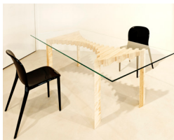
Squelette Collection Torino, IT | 2011