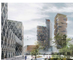
La Metamorfofi - Spina IV with Buffi Associés Torino, IT | 2010

Intern at Studio Pession Associato | 2010 | Torino, IT