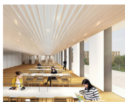
Veterinary University of Lodi Kengo Kuma & Associates Lodi, IT | 2014

Freelance Environmental Consultant | 2014 | Torino, IT