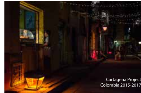
Cartagena Project Colombia 2015-2017