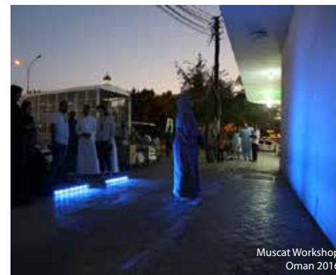
Muscat Workshop Oman 2016