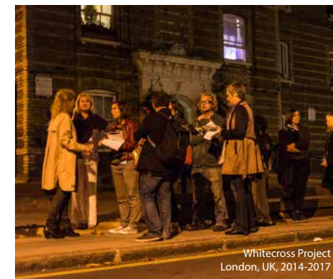
Whitecross Project London, UK, 2014-2017