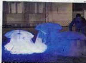
La "Jellyfish Invasion" posizionata in via Don Orione.

FESTE Via Padova, per alcuni un buco nero dove imporre il coprifuoco e militarizzare. Per altri un laboratorio dove si incontrano, mescolano e contaminano decine di nazionalità, dove gli abitanti vogliono dimostrare che "Via Padova è meglio di Milano". Che poi è il titolo della "due giornate" - sabato 21 e domenica 22, dalle 10 a sera inoltrata - di eventi pensati per "riscoprire gli spazi del territorio e valorizzare le storie di chi ci abita".