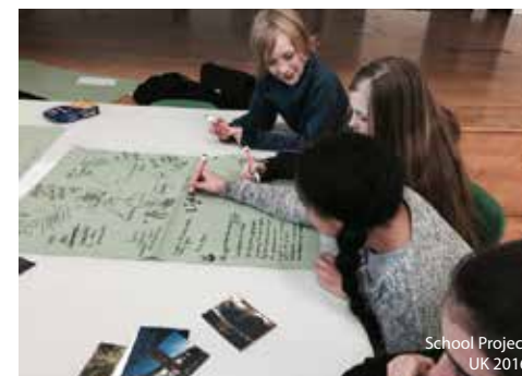
School Project UK 2016