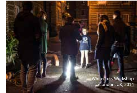
Whitecross Workshop London, UK, 2014