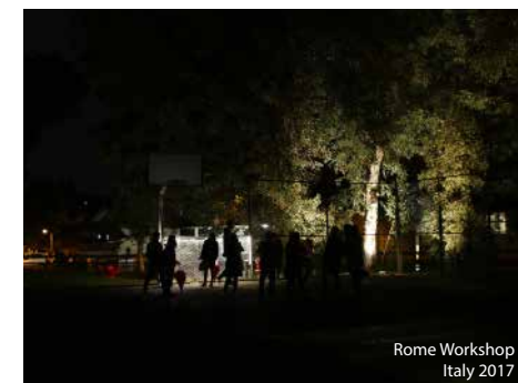
Rome Workshop Italy 2017